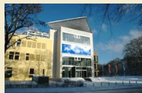
Universitätsklinikum Essen Hufelandstr. 55 45147 Essen

Epidemiology is an interdisciplinary oriented field. PhD students traditionally proceed to their epidemiological doctorate coming from various scientific branches.